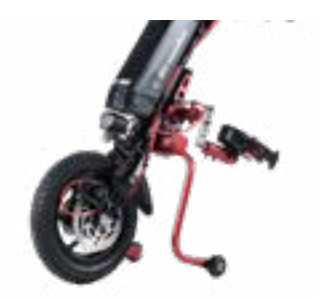
Stand, with wheels