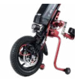
LED light, Carbon fender, discbrake