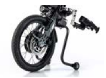
// STE060025 Mechanical double disc brake