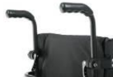
Push handles height adj.