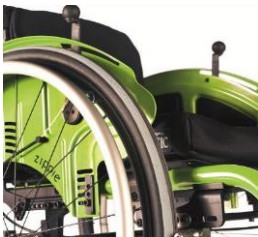
Aluminium sideguard with fender (here also with Safari wheel lock)