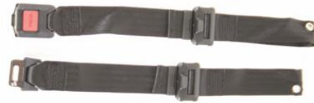
Lap belt with buckle