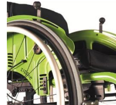
Push to lock brake Safari