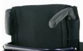
Push handles fold-down