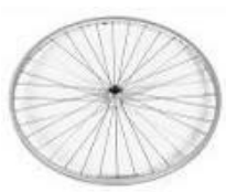
Rear Wheel Design