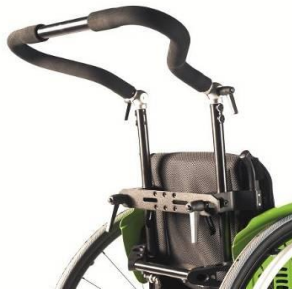
Push bar - height, angle and width adjustable