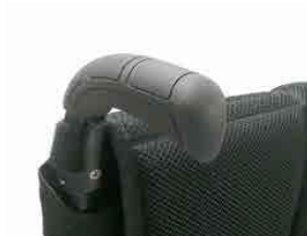
Push handles long