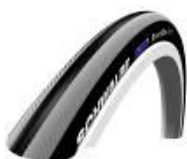
Right Run Fine Profile