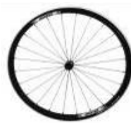
Rear Wheel Proton