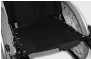
Seat sling with 1 utility bag