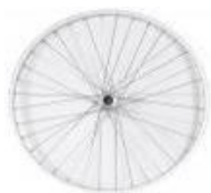
Rear Wheel Universal