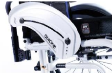
XFF040103 Aluminium, cold weather protection, fender