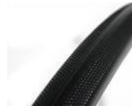
XFF070102 Tyre, puncture proof