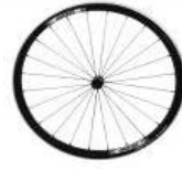
XFF07000 Proton wheel