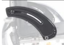
XFF040101 carbon fibre, cold weather protection, slim