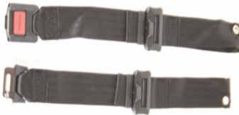
XFF 090018 Lap belt with buckle, metal