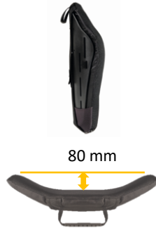
JAY J3 Mid Contour