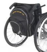
XFF090030 Back pack