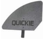
XFF040107 Composite sideguard detachable