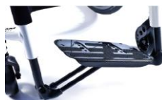
XFF050027 Footboard platform, lightweight, carbon fibre, auto folding