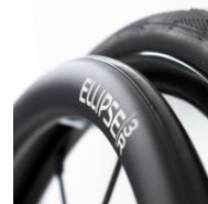
XFF070212 Handrims Ellipse 3R