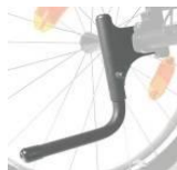
XFF090001 Tip assist