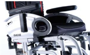
XFF04000x Desk sideguard, armpad, flip- up, removable