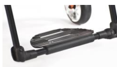
XFF050059 Footboard platform, performance