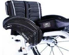
XFF040104 Carbon fibre, cold weather protection, fender