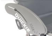
XFF040102 Aluminium, cold weather protection