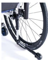
XFF090004 Anti-tip tubes, swing away