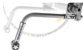
XFF090050 Anti-tip tubes, plug in, pair