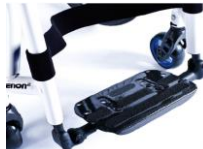
XFF050132 Footboard platform, lightweight, carbon fibre