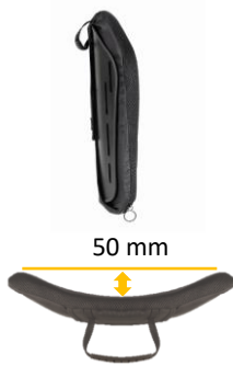
JAY J3 Shallow Contour