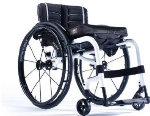
XFF010012 / 13 Open Frame