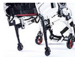
XFF090010 Transit wheels