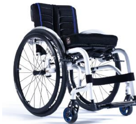
XFF090020 / 21 Hybrid frame