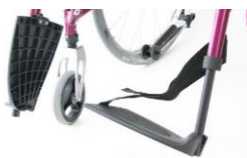
Angle adjustable footplates (composite)