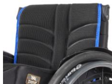
EXO PRO backrest sling (EXO Evo version)