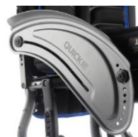
Aluminium sideguard with fender