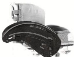
Carbon Seitenteil mit Kleiderschutz