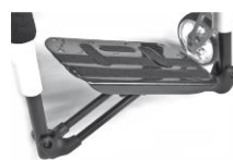
Autofolding carbon board