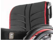
EXO backrest sling (EXO Evo version)