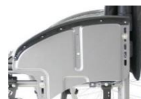
Aluminium sideguard with fender