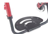
Aluminium board (XENON performance)