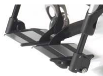
Aluminium Footplate divided