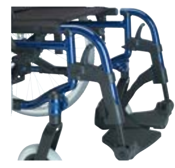
Compact frame: 80° hangers