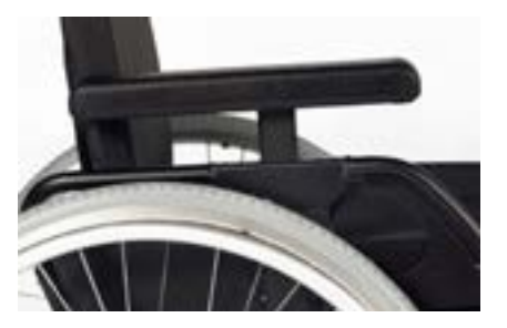
Armrest with armpad, height adjustable