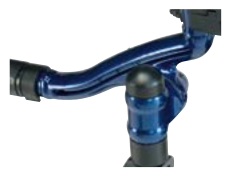
Innovative castor housing