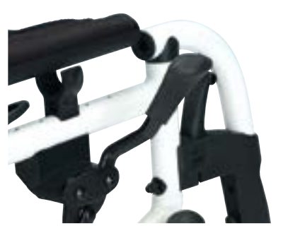
Seat frame receiver & active campling

The Style X and X Ultra chair incorporates many elements specifically though to increase rigidity. Like back tube and seat frame receivers, active seat rail fixation, two strong arm cross braces and the innovative castor house. All these parts are made of aluminium to provide strength and durability while keeping the chair lightweight.