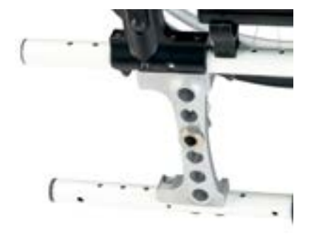
Aluminium axle plate with aluminium back tube receiver