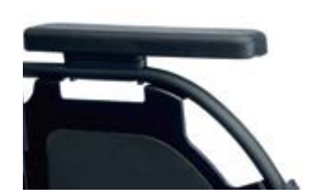
Armrest with armpad, tool height and depth adjustable